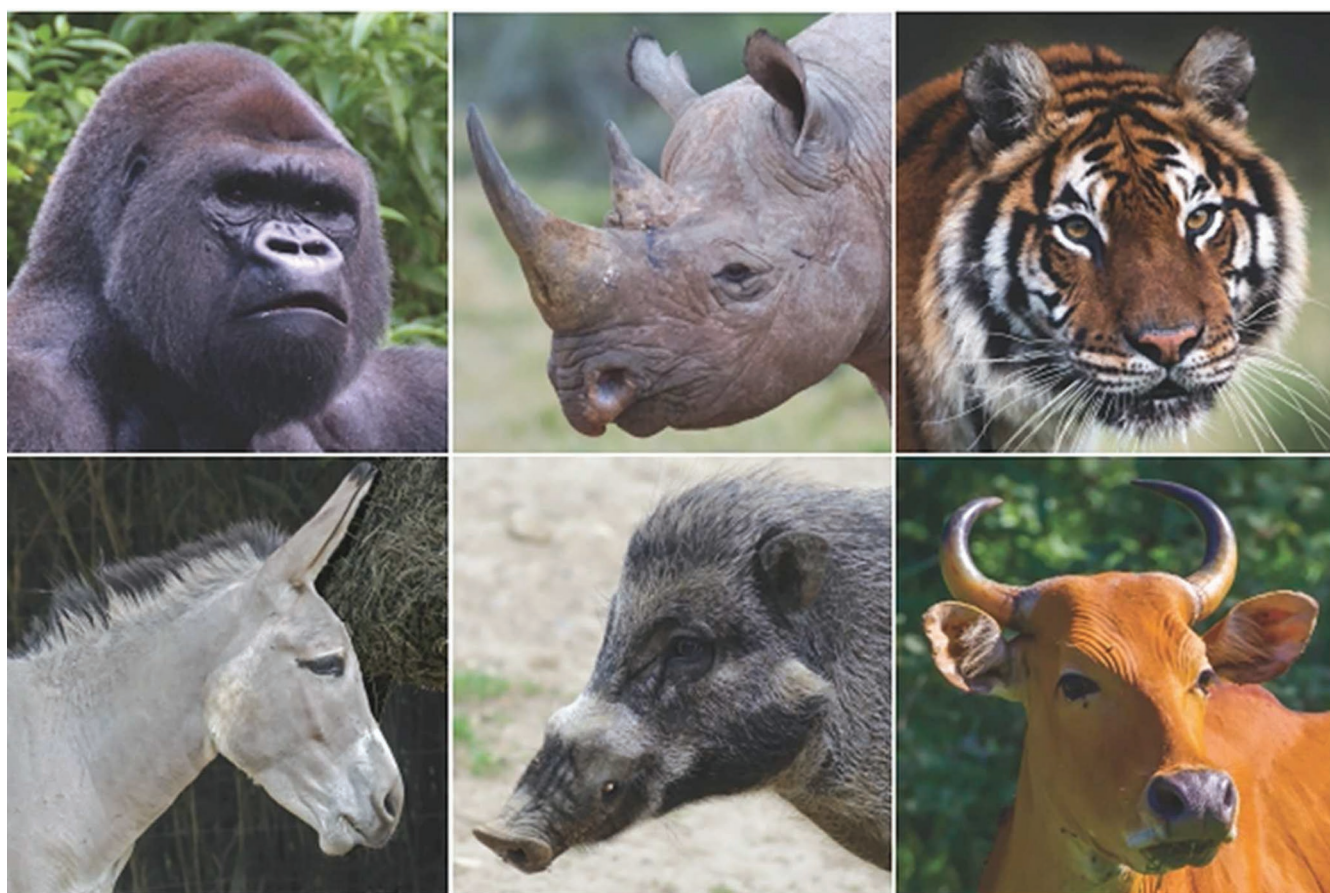
Figure 2. Photographic examples of threatened megafauna. Top row left to right: photos of well-known species, including the Western gorilla ( Gorilla gorilla ) (CR), black rhino ( Diceros bicornis ) (CR), and Bengal tiger, ( Panthera tigris tigris ) (EN). Bottom row left to right: photos of lesser-known species, including the African wild ass ( Equus africanus ) (CR), Visayan warty pig ( Sus cebifrons ) (CR), and banteng ( Bos javanicus ) (EN).

imperiled (tables S1 and S2). Most of the world's megaherbivores remain poorly studied, and this knowledge gap makes conserving them even more difficult (Ripple et al. 2015).